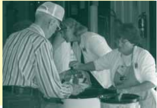
Hawkeye board members and employees served pork sandwiches, beans and salads to members.