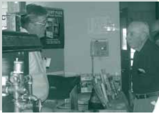
The Member Services department kept busy throughout the evening explaining to members the various services that Hawkeye offers.