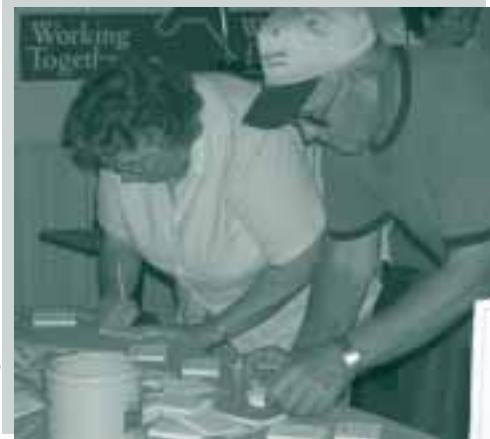
Members entered their names for a chance to win an REC crock. The winners were: