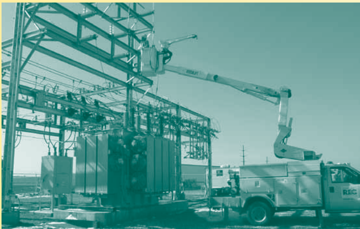
Hawkeye employees received training and then energized the Crane Creek Substation that will serve the Homeland Energy Ethanol Plant. Lineman Travis Cummings works at the new substation.

use approximately 37 million bushels of corn annually. That is good news to Northeast Iowa and the farming community. Ethanol is sold nationwide as a high-octane fuel that delivers improved vehicle performance while reducing emissions and improving air quality. The ethanol plant is located between Lawler and New Hampton on Highway 24.