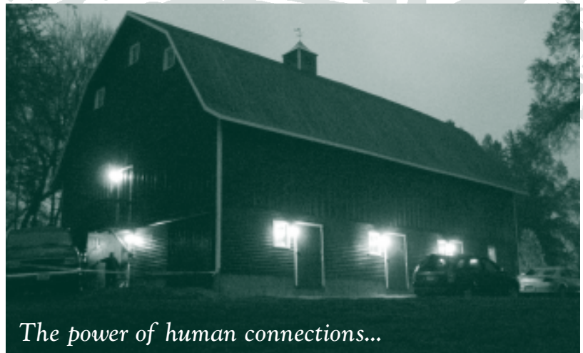
The power of human connections...

some of these barns are being utilized in the traditional way, others have found new life in changing times.