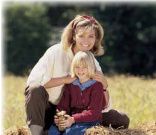
Visitors are encouraged to take seat on a straw-bale to enjoy a picturesque view of the Northeast Iowa countryside on a wagon-ride for just $2. A special thank you to neighbor's Ron and Mary Oyløe for their use of the tractor and wagon to make the hayrides possible.